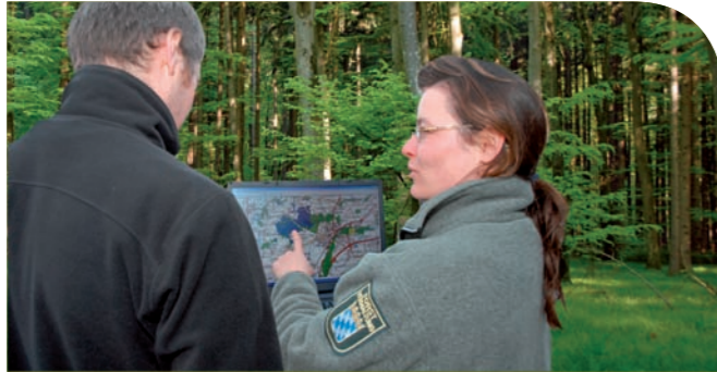
■ We are developing climate risk maps for tomorrow's forest, and, in doing so, we are creating an important foundation for forward-looking forest consulting.